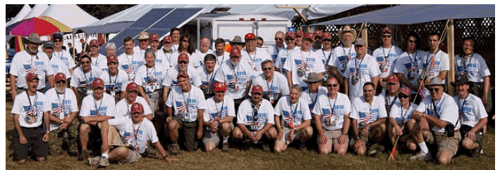
This is a group photo of some of the volunteers participating in the Electricity and Electronics Merit Badge programs at the 2010 Jamboree